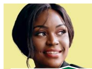
High Quality Experience