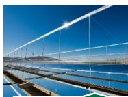
Experts in Leading Tech