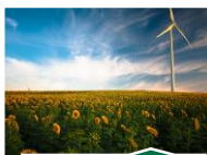
Committed to Transition